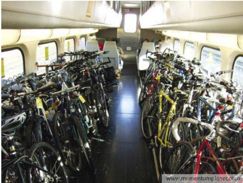
Caltrains bicycle cars 2011: http://www.caltrain.com/Page845.aspx